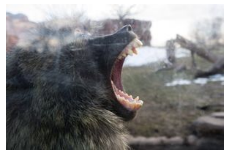
A baboon sits on a rock in its enclosure at the Toronto Zoo on Tuesday, November 24, 2015.

After the matriarch died last year, a vicious battle erupted among the female baboons at the Toronto Zoo for her throne that endured for months, prompting a brief closure of the exhibit and providing a fascinating glimpse into the animals' behaviour.